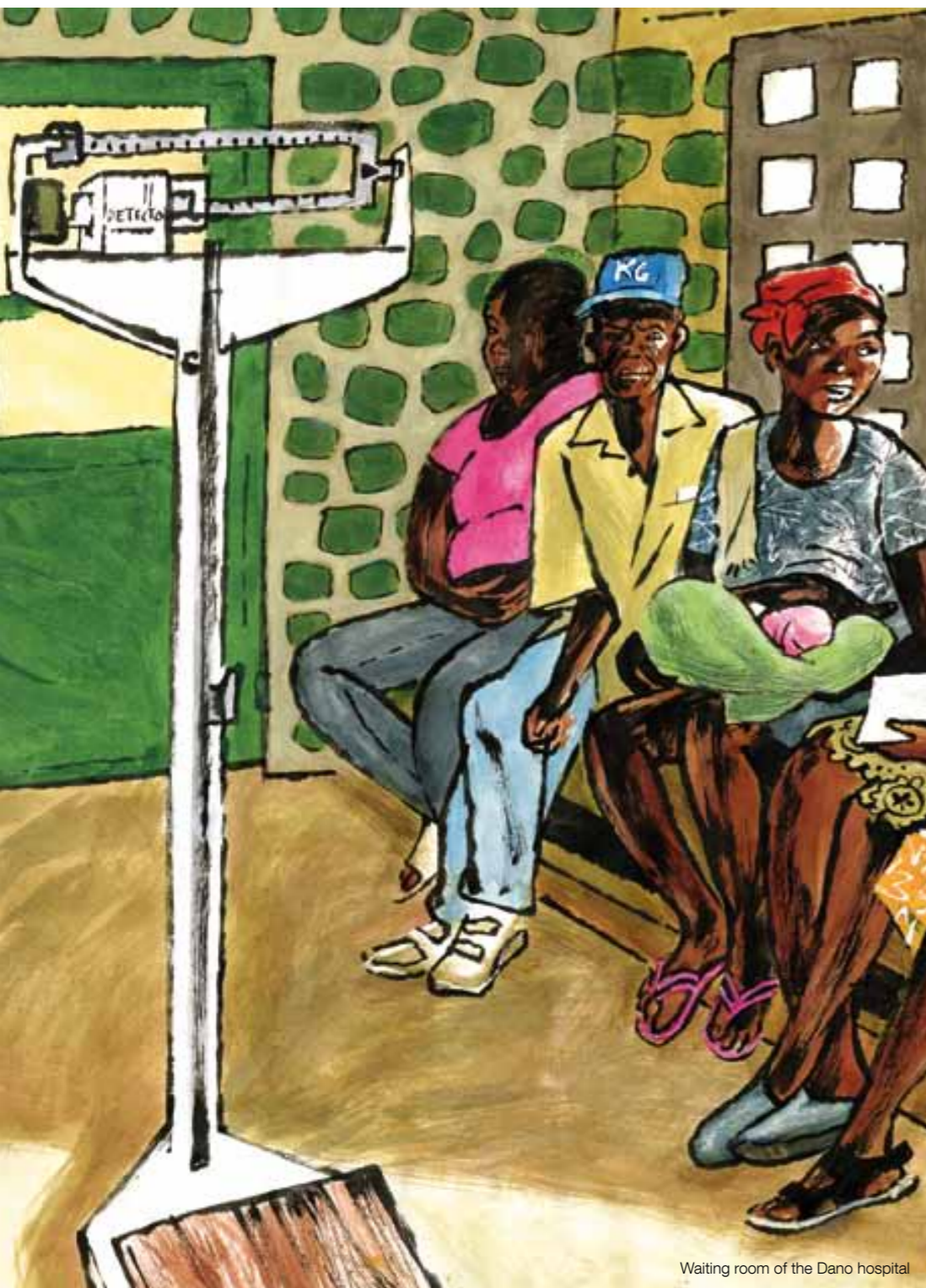
Waiting room of the Dano hospital