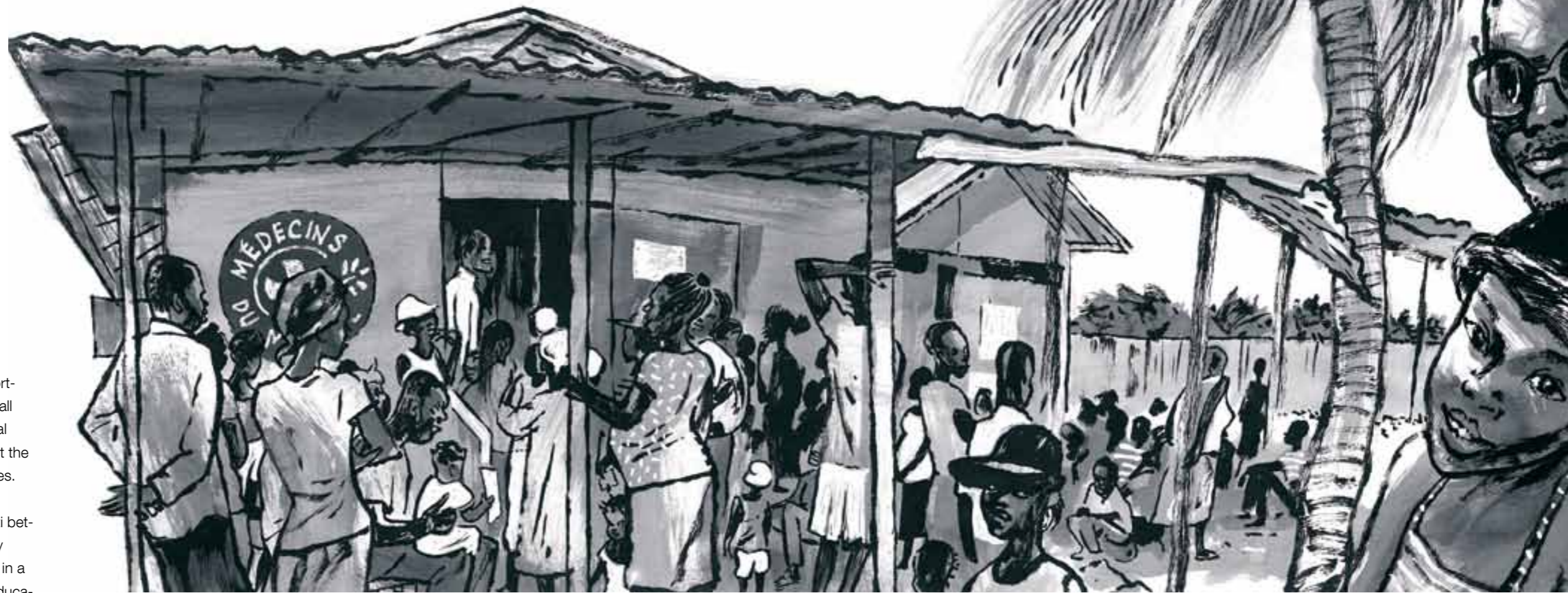
Queue at the hospital in Cité Soleil

For in Haiti, temporary solutions, taken to confront the urgency of the situation and the new emergencies that relentlessly follow, have sadly become long-term... if not permanent. Therein lies the dilemma. Haitians have perfectly understood this and are under no illusions. «Reconstruction is not moving forward enough» we hear again and again. They know better than anyone that it is not for the NGOs to rebuild their country. Without an international plan wor-